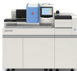
AIA-900 with 9 tray sorter 90 Tests Per Hour Also available with 19 Tray Sorter