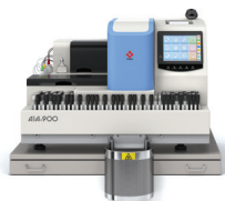
AIA-900 Benchtop 90 Tests Per Hour