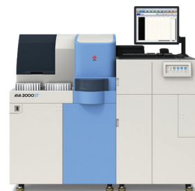
AIA-2000 200 Tests Per Hour