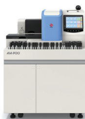
AIA-900 Loader Model 90 Tests Per Hour